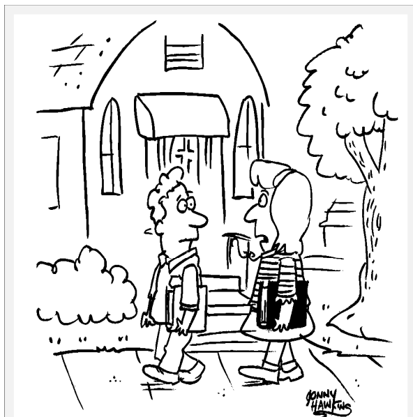
“They must have had some form of email. The Apostle Paul wrote the epistles.”